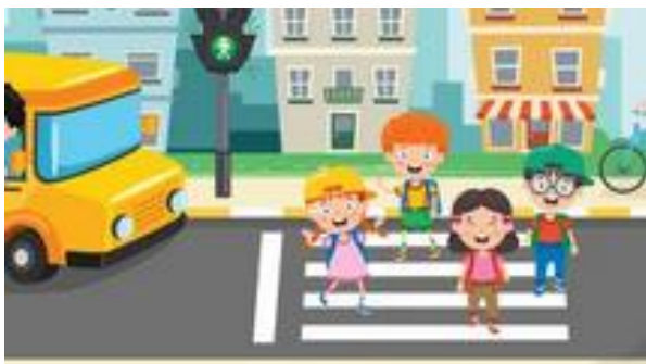
cross the road