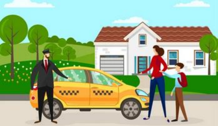
take a taxi