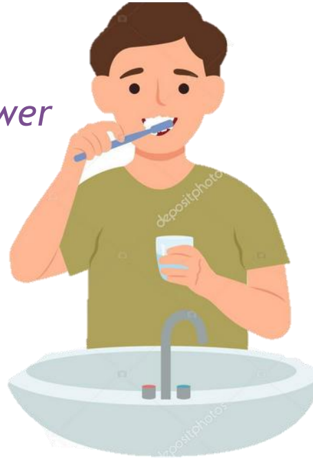
brush your teeth