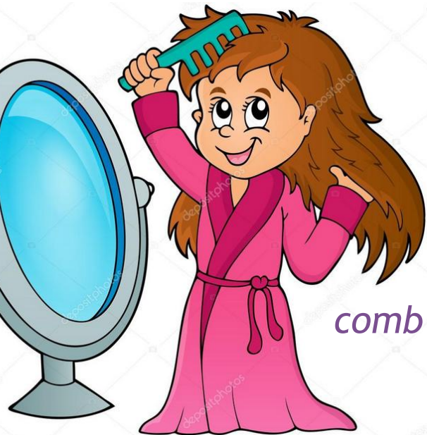
comb your hair