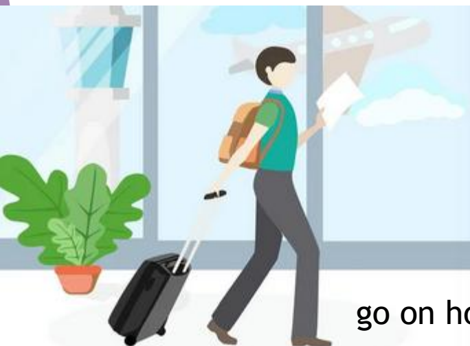
go on holiday