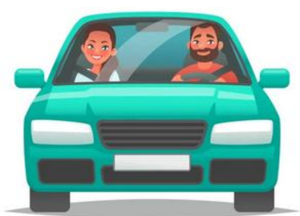
drive a car