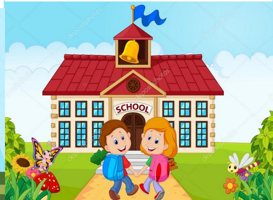
go to school