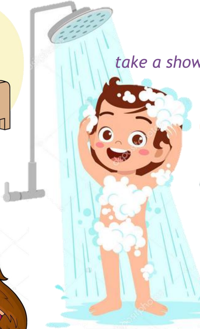
take a shower